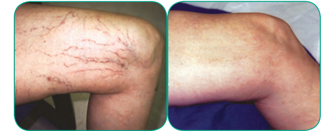
BEFORE | AFTER 4 IPL treatments

Lumenis IPL is successful in the removal of spider-like veins; networks of blue or red blood vessels. IPL uses precisely targeted pulses of light energy to destroy the abnormal dilated blood vessels, causing the unwanted veins to be reabsorbed by the body.