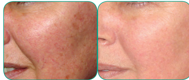
BEFORE | AFTER 4 IPL treatments

Little red lines (broken capillaries) that appear on the nose and cheeks are commonly found in fair, thin-skinned people or as a result of environmental exposure to sun and wind. Broken capillaries, along with chronic redness and flushing, are also characteristic of individuals with facial rosacea. Lumenis IPL addresses both problems, eliminating broken capillaries and inflammation without disturbing healthy tissue or surrounding normal blood vessels, leaving clear, even-toned skin.